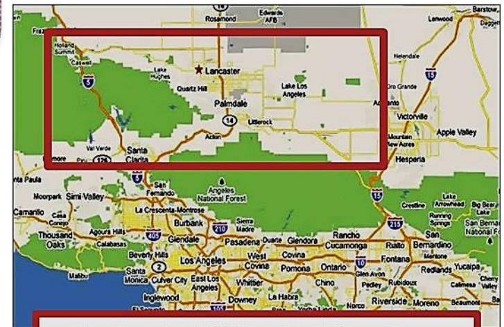
Our Current LASD Operational Support Area