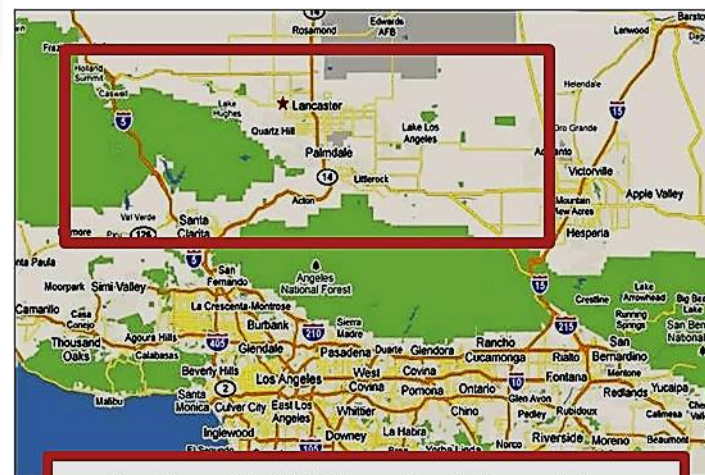
Our Current LASD Operational Support Area